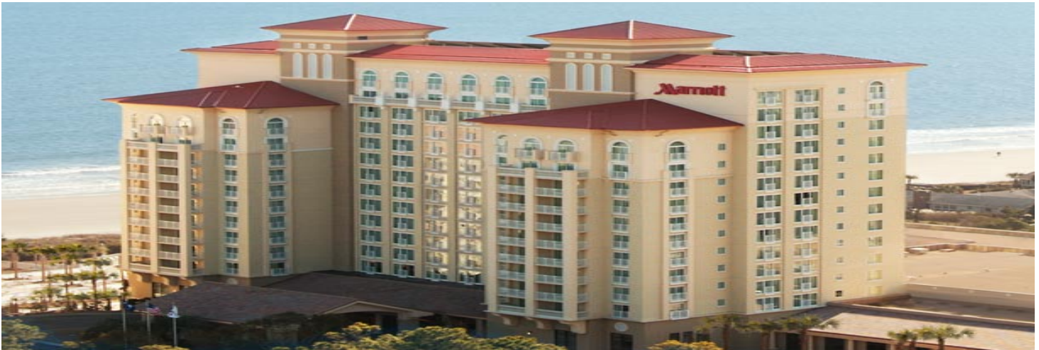
Myrtle Beach Resort & Spa at Grande Dunes

comfortable, tried, and true, to the extraordinary. What are the new trends and how can we be the writers to create them?